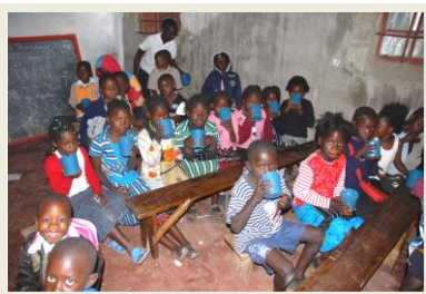
F F School Classroom

Most of the current 190 children come from impoverished families who make a living breaking stones out of limestone boulders in the surrounding area.