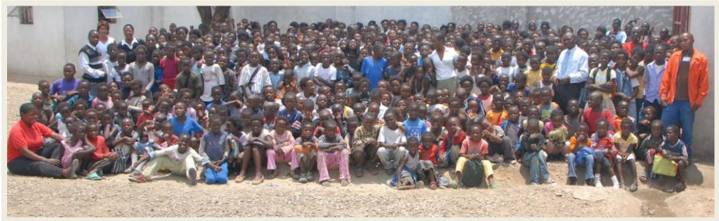
The Other Side Foundation School for OVC's in Zambia

The Other Side Foundation School for Orphans and Vulnerable Children sees to the needs of 470 students. Located in George Compound in Matero District, one of the poorest and high density slum areas, this school caters to students from Grade 1 to Grade 7. One teacher is assigned to each grade and all seven teachers carry out their duties under the guidance of an administrator.