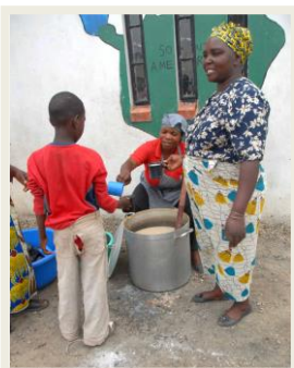
Tobwa & Bread Time

As nutrition is at the heart of health and general well-being, The Other Side Foundation provides enrolled children with at least one nutritional meal a day of Tobwa (high protein porridge) and bread.