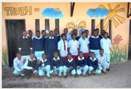
24 of the 50 Bursary Recipients

The Other Side Foundation supports promising students further their education through a Bursary award program. This program currently supports 50 children and it allows children to continue their education through Grade 12 in government schools by paying for their school fees, examinations fees and uniforms that would be otherwise financially inaccessible to students.