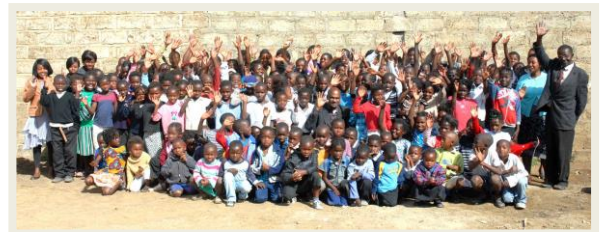
Faith Foundation School