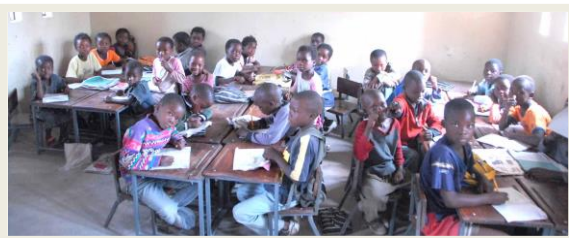
TOSF School Classroom

The Other Side Foundation believes in Empowerment through Education