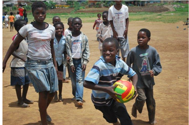
Sports and games conducted by C-Africa.

C-Africa as a student project is keen to help in particular aspects of the Foundation's work. We hope for their continued support in our programmes.