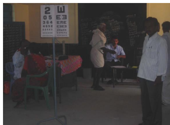
Doctors and nurses setting up a clinic and conducting eye examinations for the villagers.