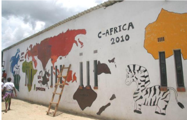
The C-Africa team helping to create a mural.