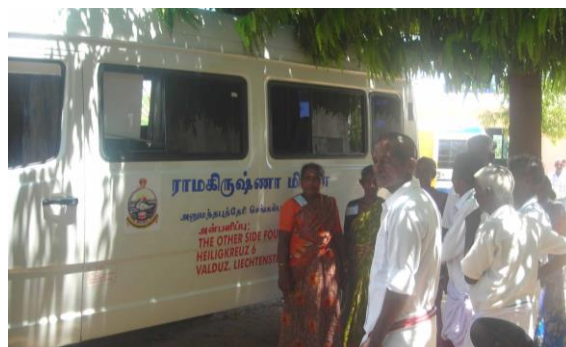
The traveller ambulance purchased by The Other Side Foundation.

In remote parts of India, villagers who are ill may be unable to get timely access to medical help. As such, our Foundation purchased a traveller ambulance in 2010, converting it into a mobile clinic to alleviate the healthcare problem there. The interior of the vehicle has been remodeled to fit in foldable seats, which then double up as examining tables, laboratory facilities, medicine cabinets and other basic mobile clinic facilities. Every two weeks, volunteer doctors and nurses go out to the field to render medical help to the villagers. They dispense medicines for minor and general ailments, and refer more serious and chronic cases to larger hospitals. The Ramakrishna Mission, apart from dispensing drugs and homeopathic and allopathic medicine, also conducts eye camps to help with vision impairment.