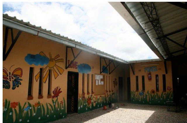
The classroom block – inner courtyard