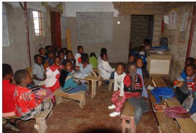
Faith Foundation School at Kaniyama – a simple, unfurnished classroom. The school also does not have many other facilities to depend on.

It bears emphasis that our involvement with the Faith Foundation Community School remains secondary to our responsibility as main operator at The Other Side Foundation School.