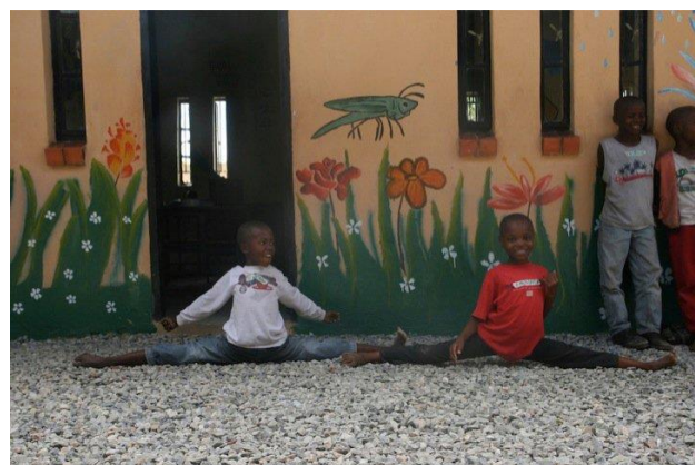
Breaktime at the inner courtyard – the children practice their splits.